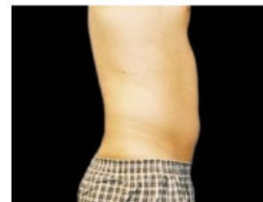
After a single treatment. Loss of 2.8 cm in circumference

disrupts them without affecting surrounding tissues. No anesthesia is required at any stage. In clinical trials worldwide, patients report that UltraShape™ treatment is painless and that side-effects are extremely rare.